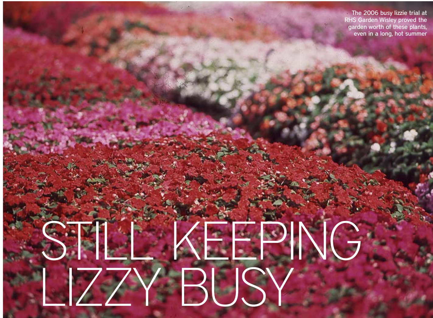
The 2006 busy lizzie trial at RHS Garden Wisley proved the garden worth of these plants, even in a long, hot summer